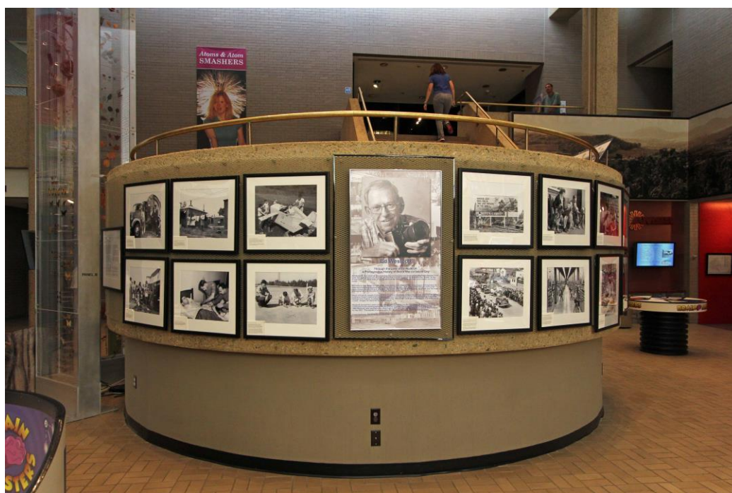
One of my favorite exhibits – famous Oak Ridge photographer, Ed Westcott