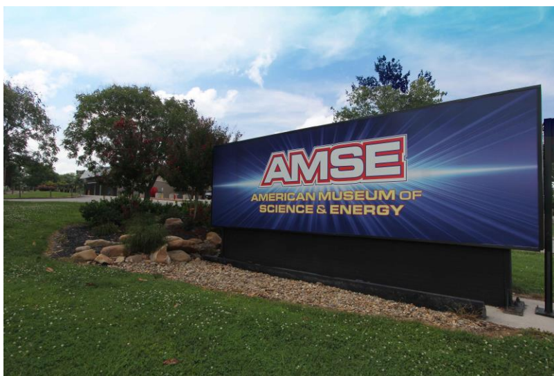
The American Museum of Science and Energy – a jewel in Oak Ridge's crown

It is up to us. What do we want to see AMSE become. Won't you help decide the future of this marvelous gem in our crown! Make your plans now to attend upcoming public discussion Community Meetings on the future of AMSE. The next meeting is scheduled for Tuesday, 8/19/14, at 6:00 PM at the AMSE Auditorium.